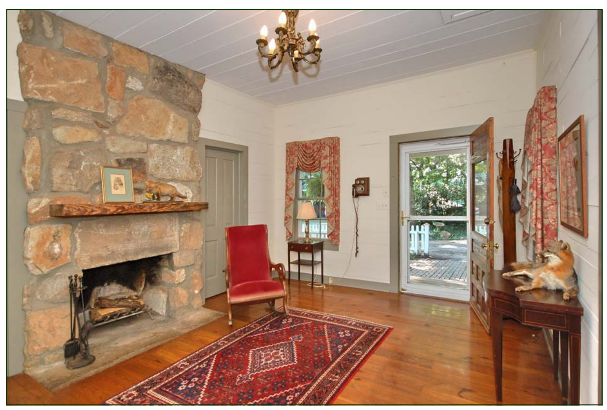
Foyer with stone fireplace.