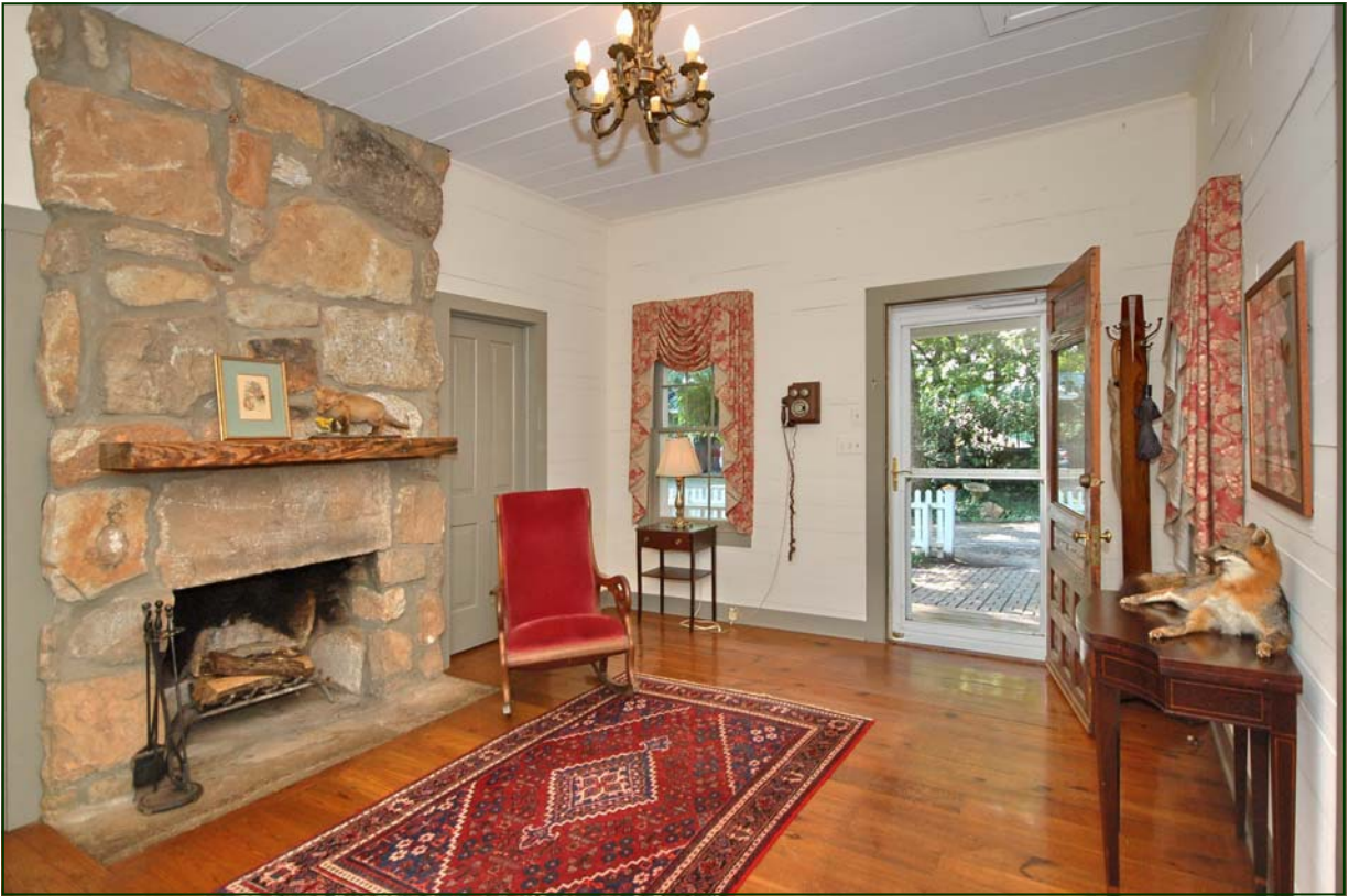
Foyer with stone fireplace.