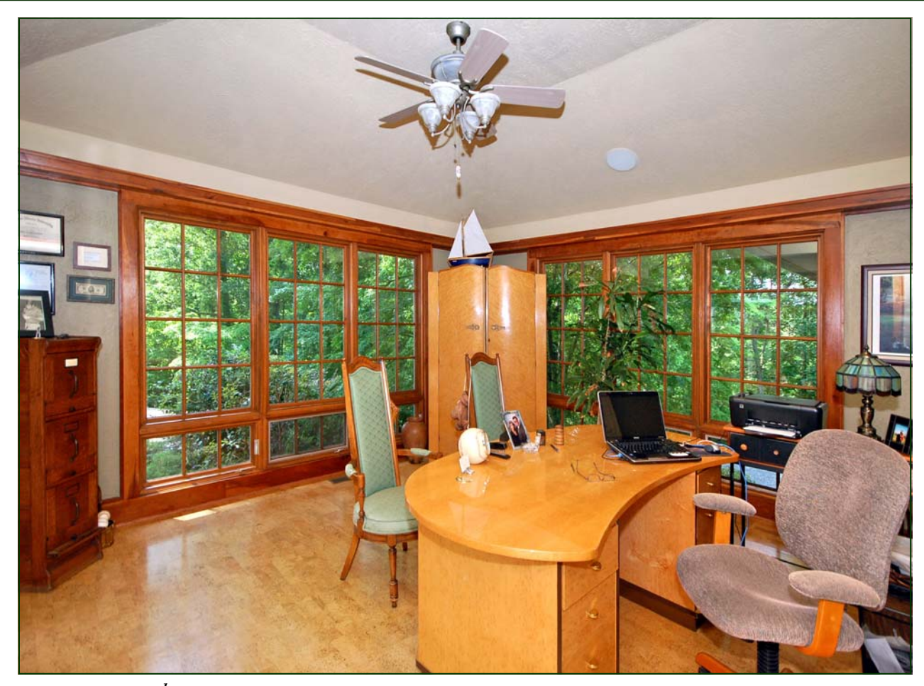
The Office or 4^{th} bedroom: For the executive what this room offers is a sign of success, for the person with a large family then this room would be bedroom #4.

Guest House is situated at the rear of the property and can be accessed by the main drive or from a separate lane out to Hunting Country Road. It is a cute 2 bedroom 1 bath cottage with a cozy living room and sitting porch.