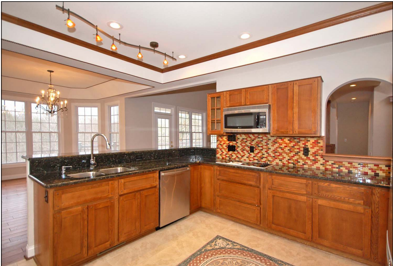
Kitchen: A delight for any chef, this custom kitchen features Mission style oak cabinets, inlaid tile floors, granite countertops and tile backsplash. Notice the stainless steel appliances and large prep area with vegetable sink. Enjoy the convenience of eat-in design and spacious walk-in pantry. Large windows bring in plenty of sunlight.